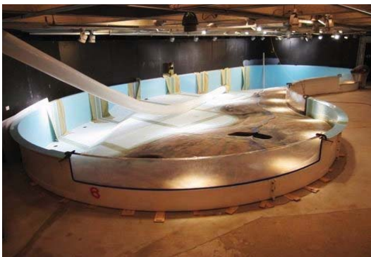
Installing New England Aquarium Ray Tank