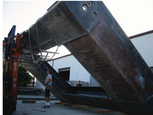
Loading the Georgia Aquarium Jelly Tank