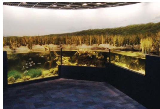
Discovery Place North Carolina Coast Exhibit